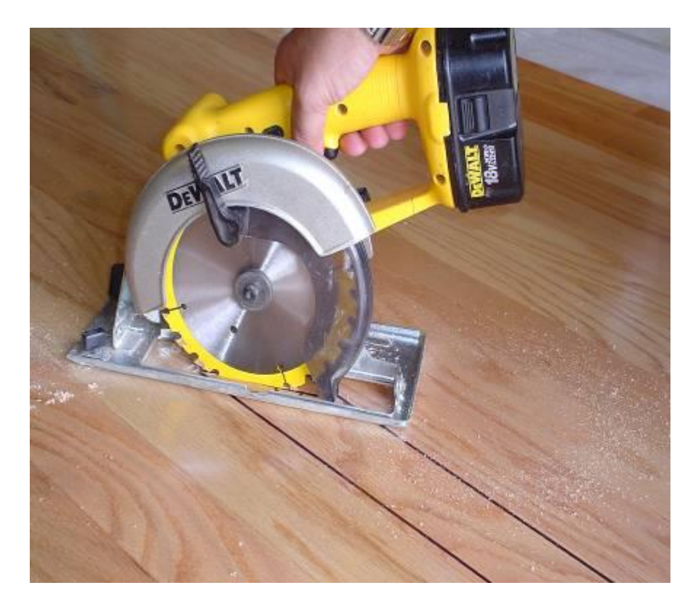
Care must be taken not to cut into adjoining boards