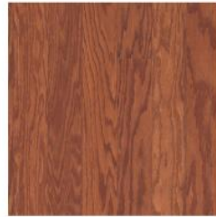
Natural 3" 5"