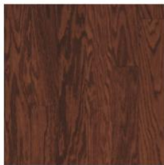
Woodstock 3" 5"