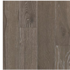
Coastal Edge 6-1/2" EAPL74L14WE