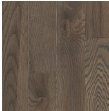
Mountainside Taupe 6-1/2" EAPL74L16WE