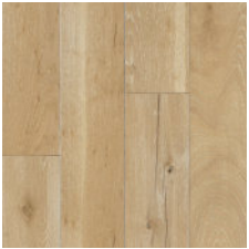
Summers Day 6-1/2" EAPL74L19WE