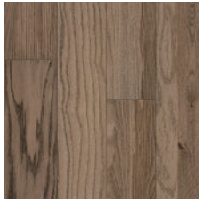
Sandy Hue 6-1/2" EAPL74L15WE