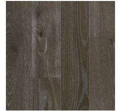
Iron Bridge 6-1/2" EAPL74L18WE