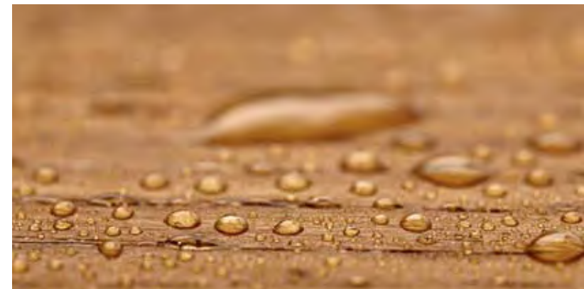
Coated with Wetworx 6S™ finish to protect against spills