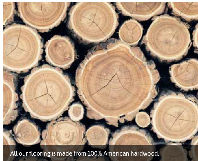
All our flooring is made from 100% American hardwood.