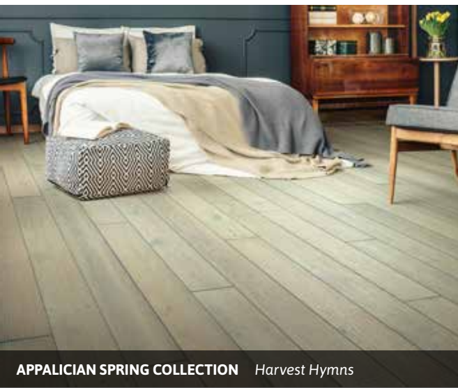
APPALICIAN SPRING COLLECTION Harvest Hymns

All scraped styles are sculpted truly by hand for an authentic look.