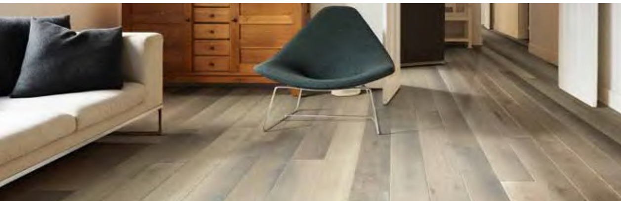
CONTROLLED CHAOS COLLECTION Inertia