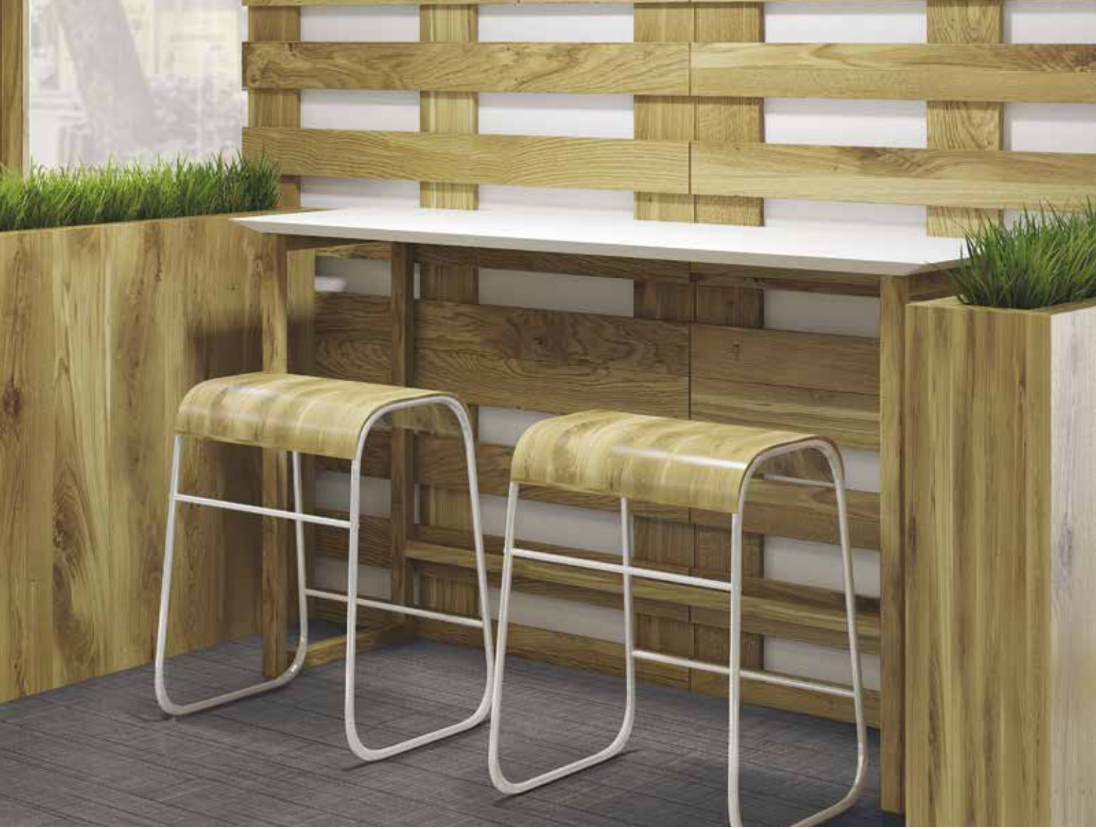
ST932 Spettro, English Grey