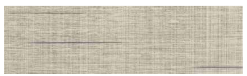
ST931 Spettro, Caspian Sand