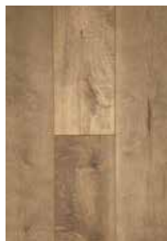
River Valley Maple