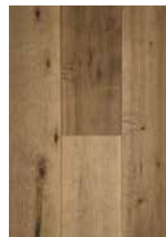
Sugar Hill Maple