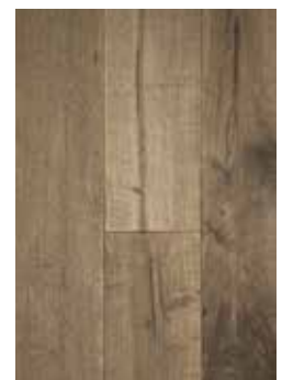
Winter Lodge Maple