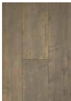
Black Mountain Maple