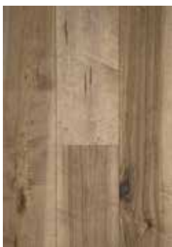
Bar Harbor Maple

Paying tribute to one of the nation's iconic mountains in the Northeast and the heritage that comes with it the all new tmbr Saddleback Maple collection presents a beautiful compliment to previous collections by tapping into the beauty of North American Maple. Combining this with a naturally inspired color range, Saddleback offers a charming option of softer grain and cleaner grading for those who are truly inspired by the mountains and all of the beauty it has to offer.