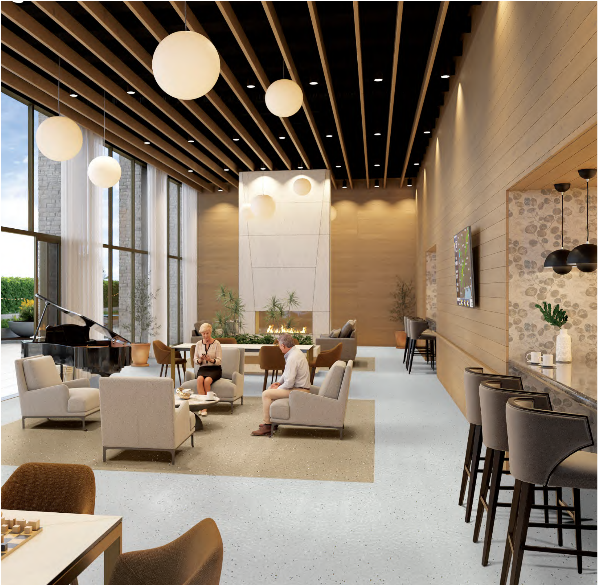
70001 White Rim, 70010 Sand Dune