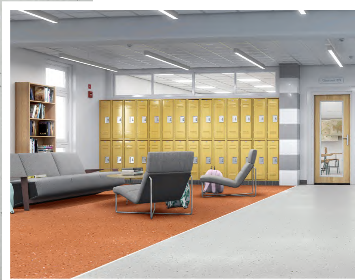
70001 White Rim, 70017 Utah