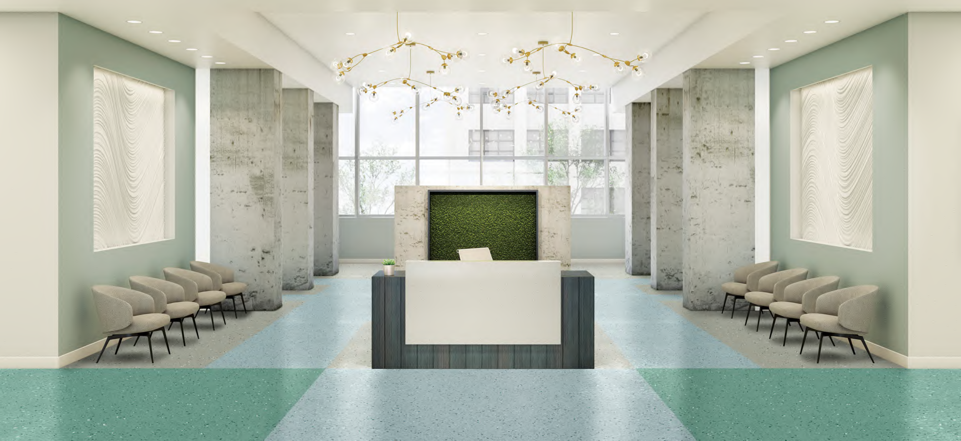
70004 Spray Foam, 70008 River Rock, 70012 Kenai Lagoon