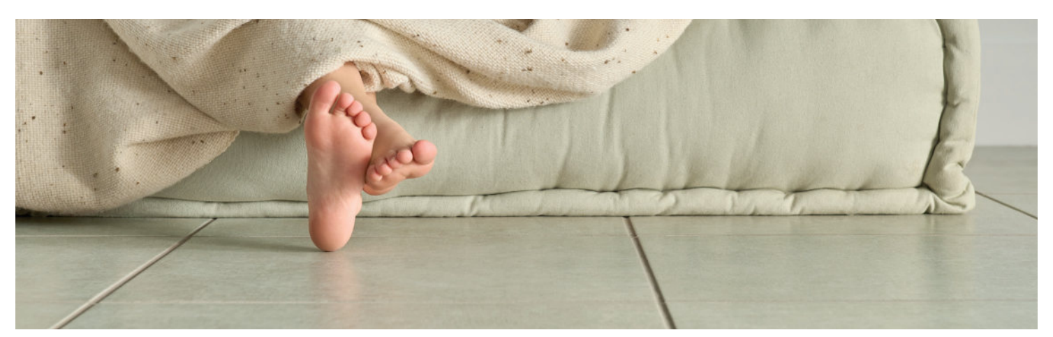
For more information, contact your Bruce distributor or AHF Products Sales Representative. Visit FloorExpert.com for complete product, technical, adhesives & maintenance recommendations.