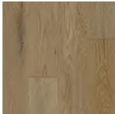
Pebble 6" EHPC65L54S