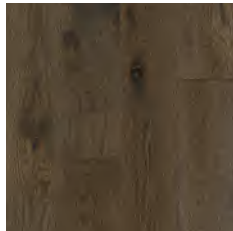
Coffee 6" EHPC65L64S