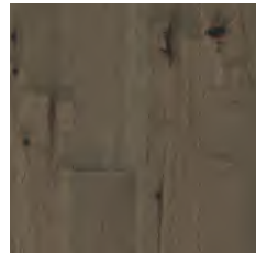
Mountain Surround 6" EHPC65L92S