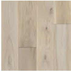
Quietude 6" EKPC65L12S