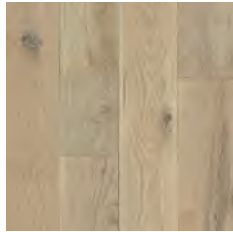
Almond 6" EHPC65L14S