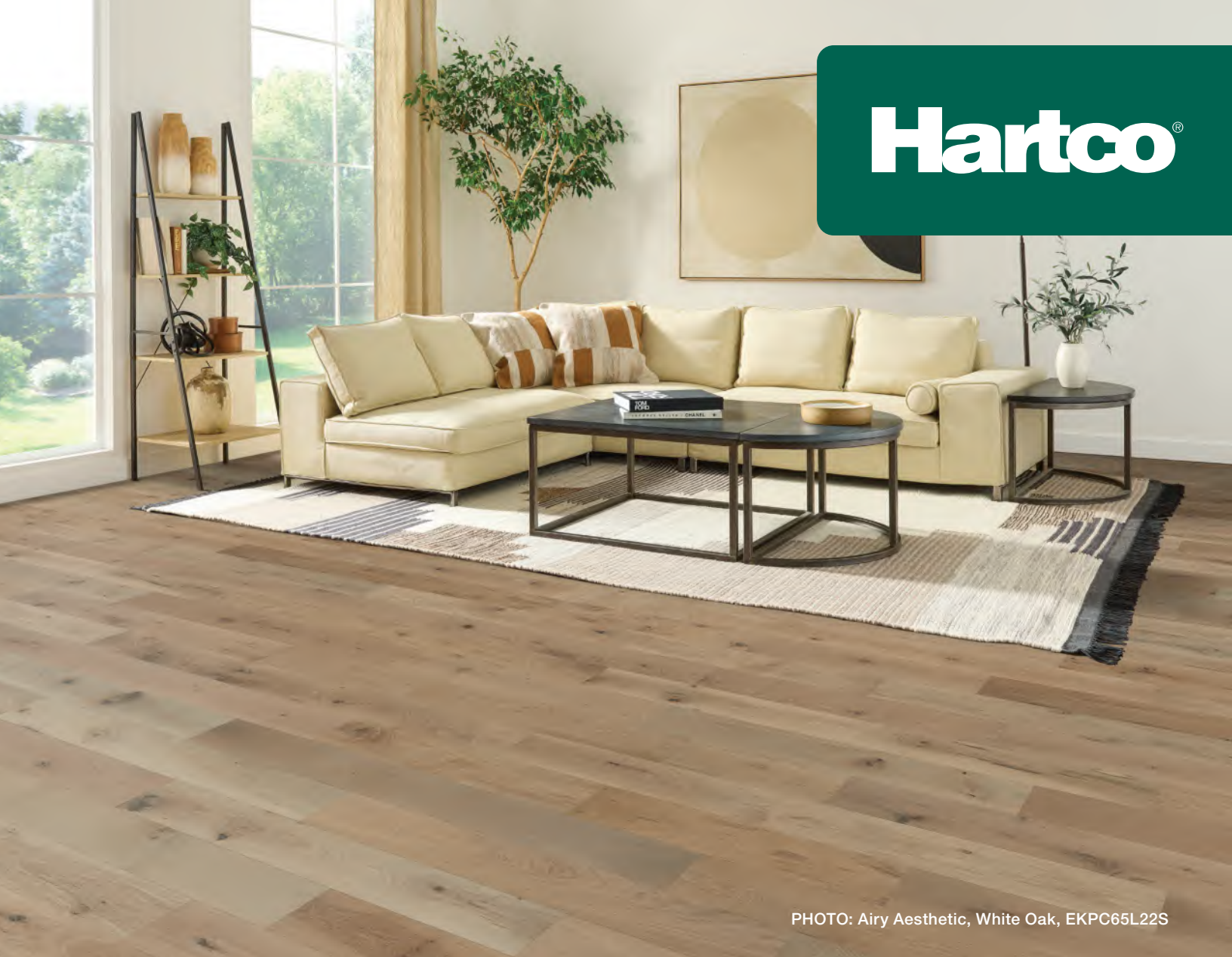
PHOTO: Airy Aesthetic, White Oak, EKPC65L22S