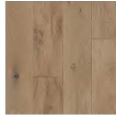
Airy Aesthetic 6" EKPC65L22S