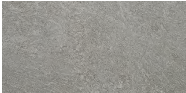
OS24433 ▶ Silver Lining