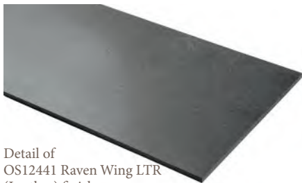
Detail of OS12441 Raven Wing LTR (Leather) finish.

† Due to this mosaic's design, caution should be used when installing on surfaces that might contact bare skin or other delicate materials. To prevent possible injury or damage from sharp corners that might be exposed above the grout line, install per ANSI 108 guidelines in order to minimize or prevent lippage.