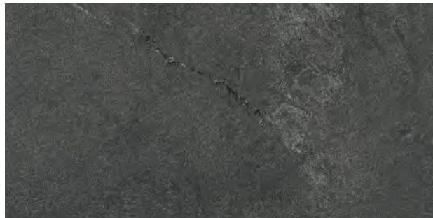
OS22438 ▶ Raven Wing