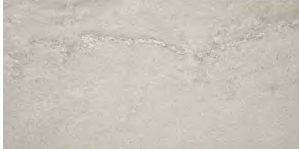
OS24428 ▶ Snow Fall